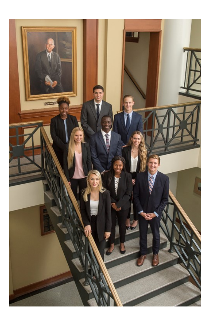
Wall Fellows Class of 2021.