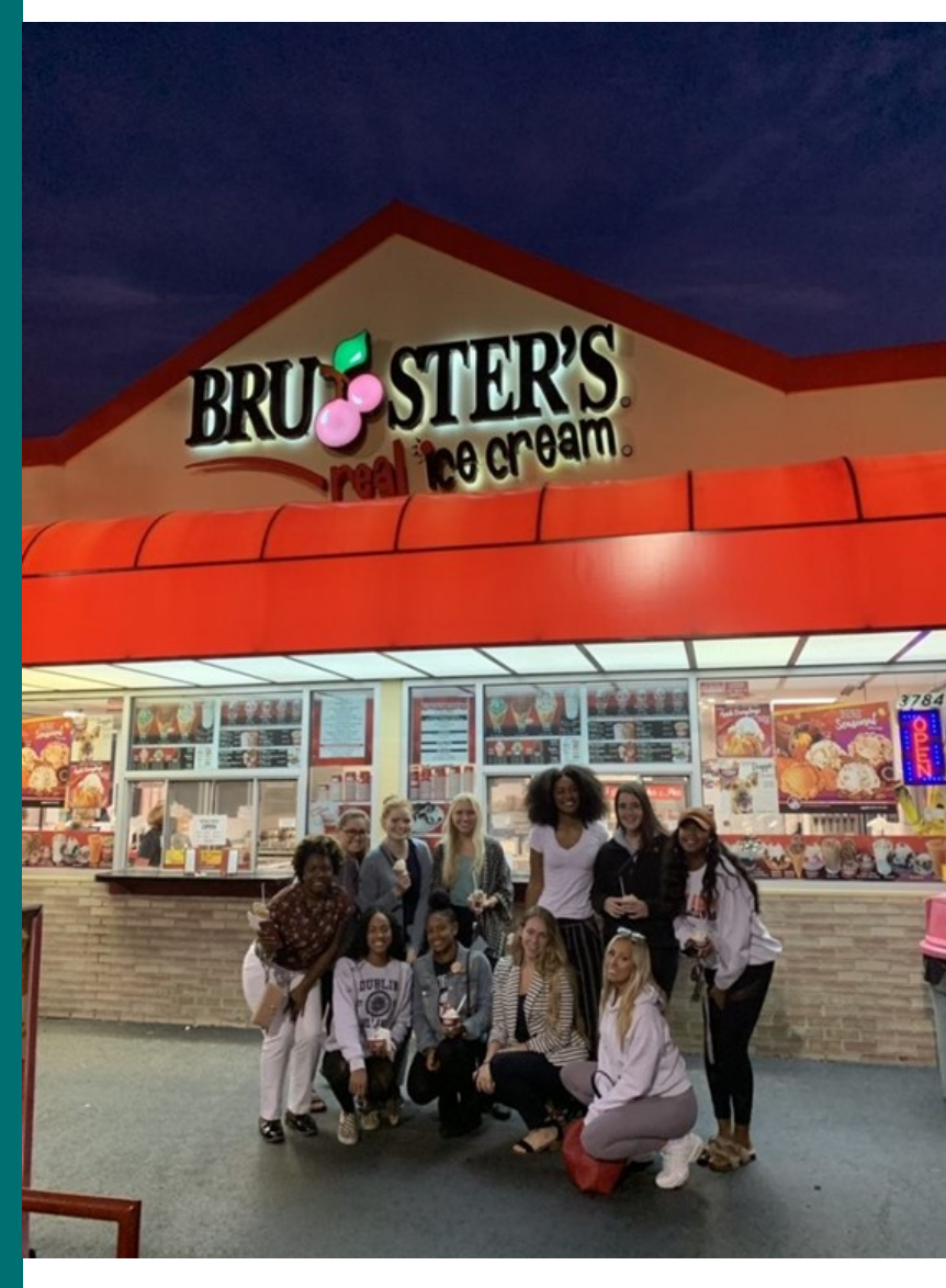
TGP participants visit Bruster's ice cream after the September event at C3 Coffee.

TGP's ultimate goal is for members to move forward with confidence and the necessary knowledge to uplift and empower both themselves and those around them.