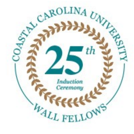
The Wall Fellows 25th Anniversary seal was created by CCU's Office of University Marketing and Communication.